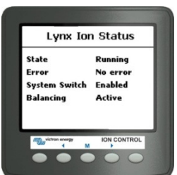
Lynx Ion Status