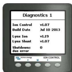
Diagnostics screen 1