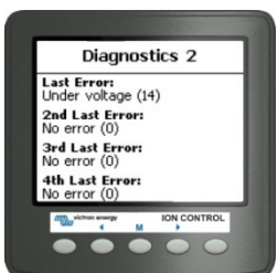
Diagnostics screen 2