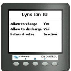
Lynx Ion IO